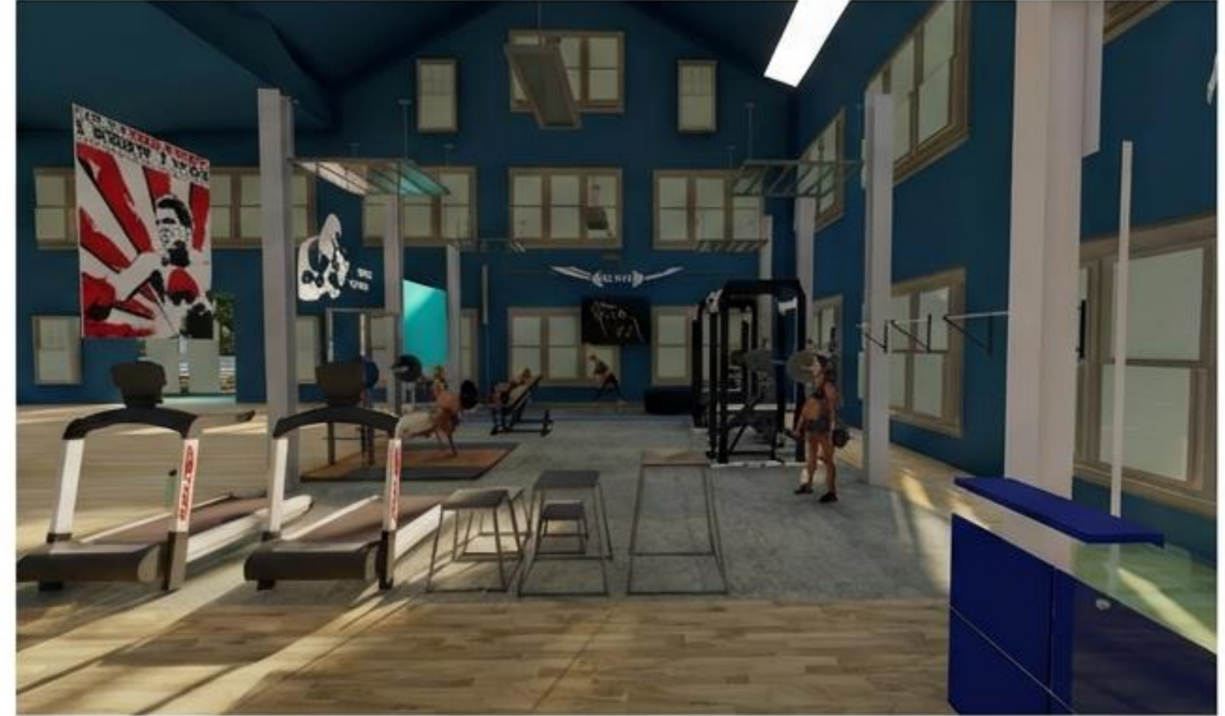
High-Performance Athletic Center

Health is approached holistically. The facility provides professional-grade clinical spaces for recovery and treatment, paired with a high-performance athletic center equipped for physical therapy, strength training, and general wellness.