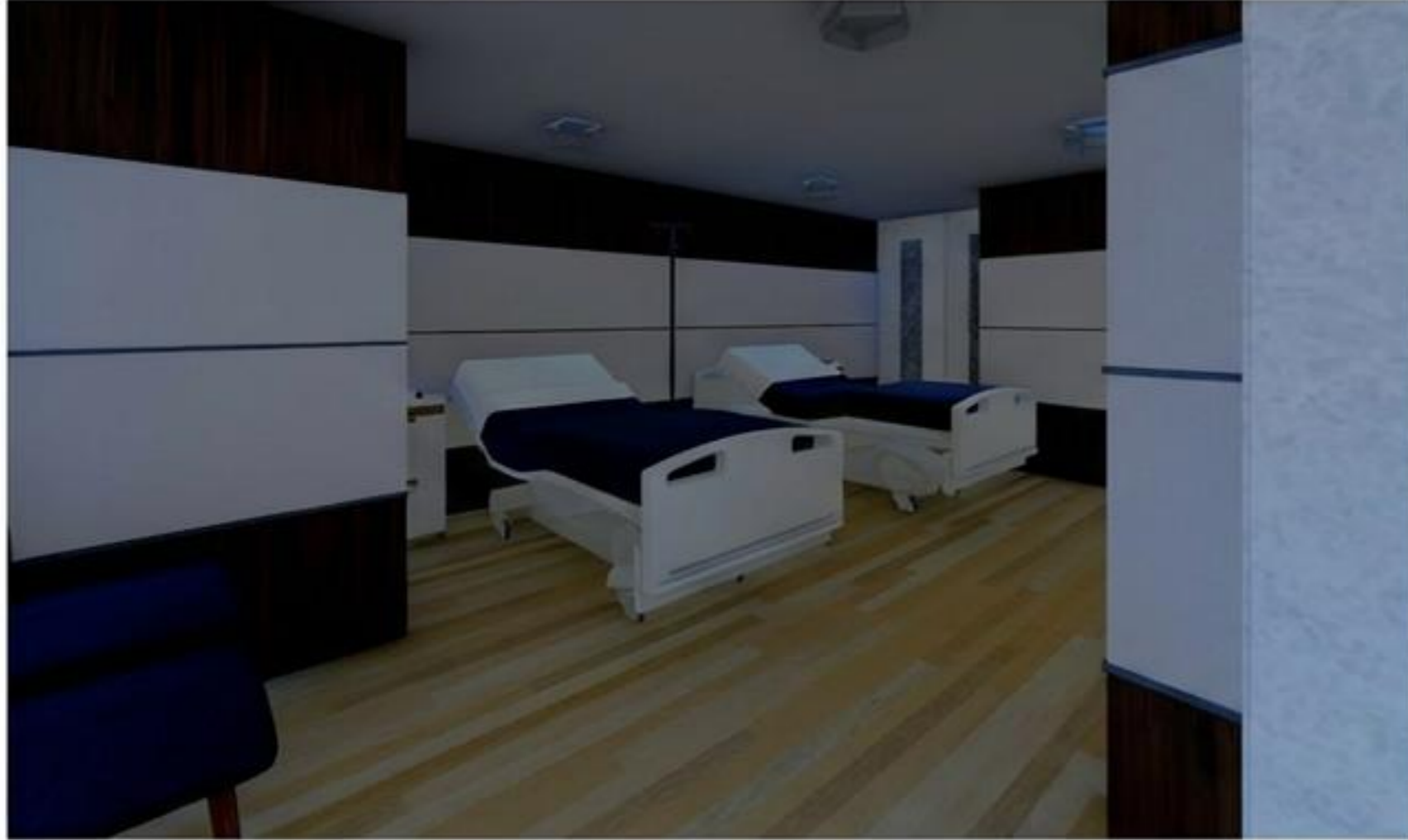
Professional Patient Care Facilities